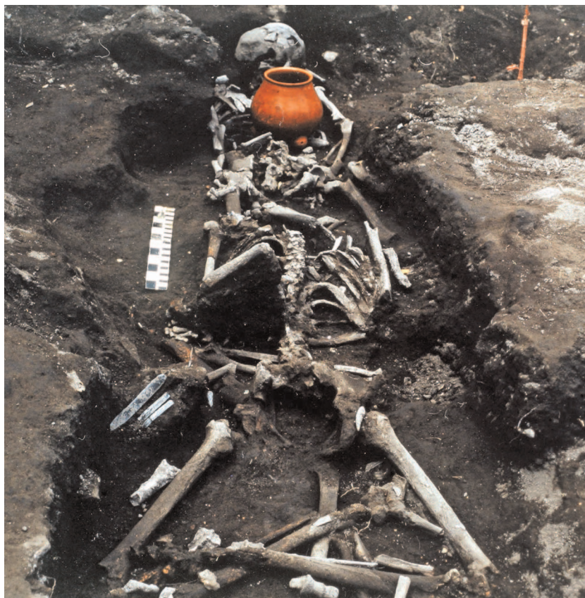
Figure 4 Marco Gonzalez Burials Str. 14/21-25, 10, 15, lkg N.

worldviews. The face-down, legs-bent-back burial position is, however, distinct from the Classic-period range and suggests an ‘intrusion’ into the Maya area of a new way of positioning oneself not just in burial but in the cosmos. It calls to mind the fact that the sixteenth-century supine burial position, also distinct from previous practices, is associated with changes in worldview that took place during the Spanish colonial period as the result of the adoption of Christianity. Our hypothesis, then, is that the face-down position with legs bent back may reflect a significant change in the way at least some members of Maya society thought individuals should be positioned in death, and hence also reflects a change in the way death (and the otherworld/afterlife?) was perceived and by implication the way in which killing was socially sanctioned.