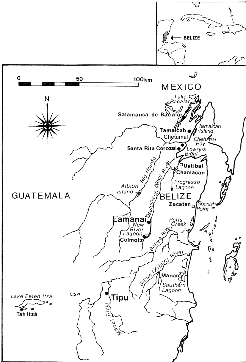
Figure 1 Map of Belize showing locations of Tipu and Lamanai and other known Spanish-period communities in northern Belize (drawing by Debora Trein and Emil Huston).

2009; White et al. 1994). Lamanai went on to be occupied during the British colonial period (Mayfield 2010; Pendergast 1982b).