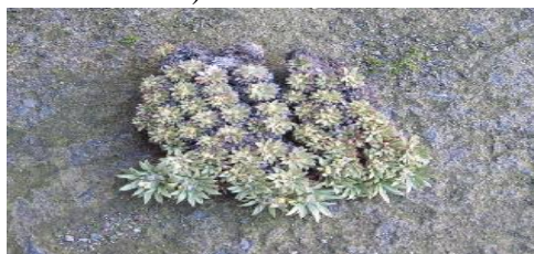
Figure 2 Habitat of A.monantha (Torres del Paine, Voucher 3363)