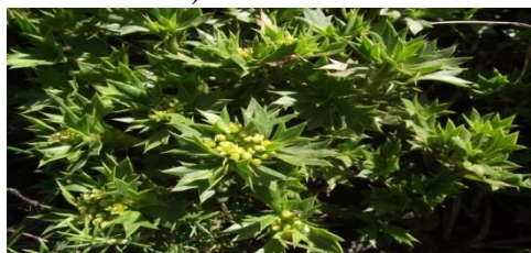
Figure 1 Habitat of A.spinosa (Pantanillo, Voucher 3360)