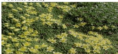
Fig 3 Habitat of A.monantha (Enladrillado, Voucher 3362)