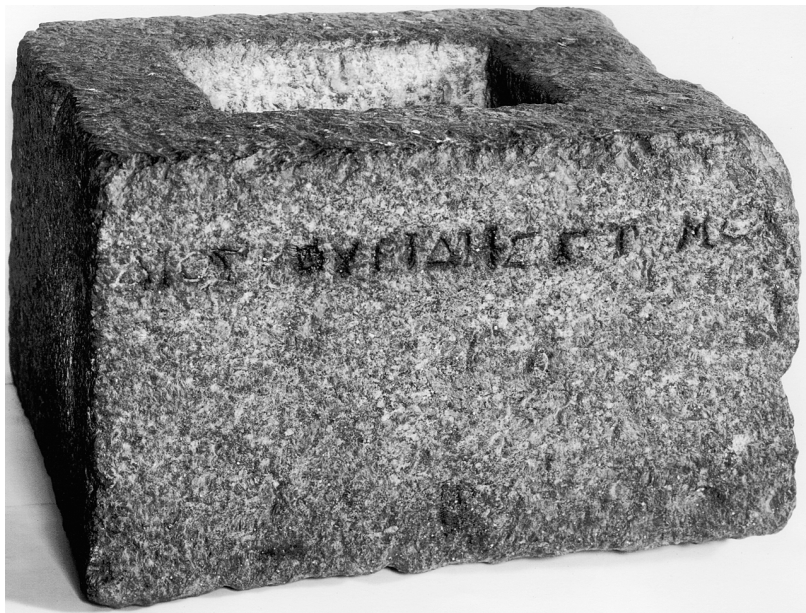
FIGURE 2. Photograph of granite block

They do not appear to rest on any good ancient authority, they were repeated from author to author, and when their consequences are examined, they lead to impossibilities and absurdities. The actual numbers were probably lower, perhaps by as much as one order of