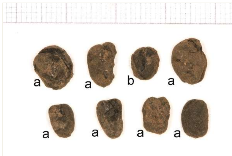
Figure 3 - Seeds of (a) Vicia faba var. minor and (b) Lupinus angustifolius (Layer 5697).