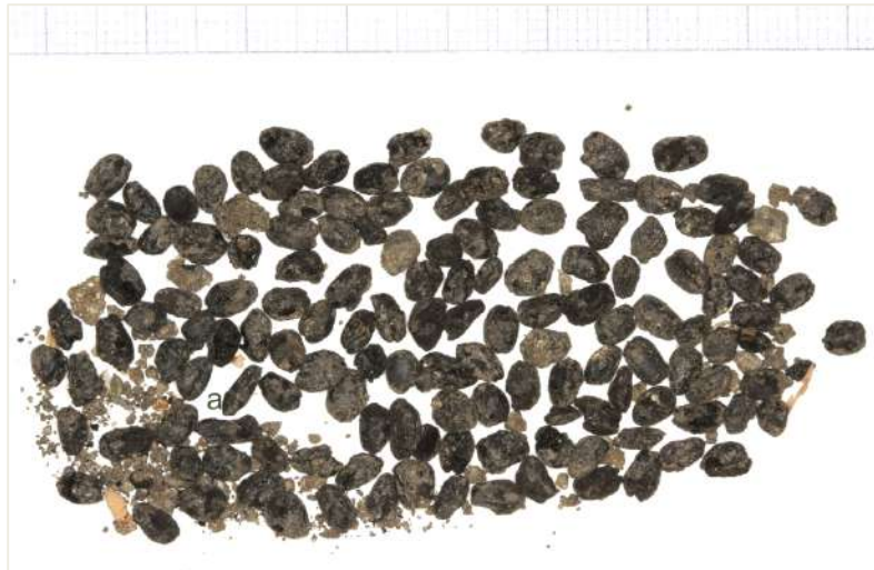
Figure 2 - Caryopses of naked wheat and (a) one caryopsis of Avena sp. (Layer 9096).