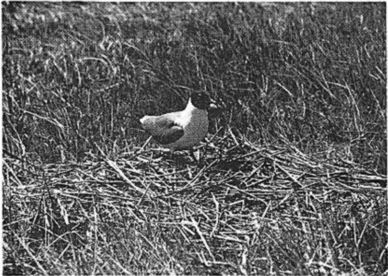
FIGURE 1. Laughing Gull holding an eggshell in its beak. The bird may simply drop the shell over the nest rim, walk with the shell from the nest, or fly off with the shell.

nest cup. Of the eggshells in the nest cup many belonged to newly hatched chicks and would probably have been removed eventually. One hundred forty-five (50%) of the shells were found out of the nest within 2 m of the nest rim; 87 (30%) of the shells were within 25 cm of the nest rim. About 9% (25 shells) were between 2 and 4 m from the rim, whereas 43% (127) were missing (not found within 4 m of the nest). Of the 102 eggshell removals observed from a hide, 51% (52) involved a gull flying with the shell away from the nest. Approximately 26% (26) of the shells were picked up by gulls that walked from the nest before dropping the shell; 24% (24) of the eggshells were picked up and simply dropped over the nest rim (Fig. 1). Observations on identifiable individuals and pairs revealed that some birds repeatedly flew off with eggshells, whereas others consistently walked with or dropped shells from the nest.