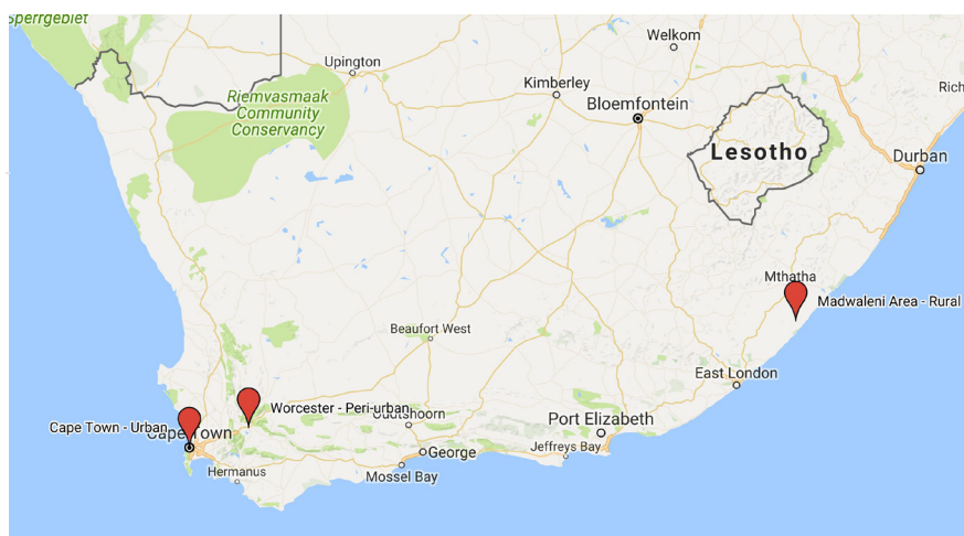
Figure 1. Map of Research Settings (Produced by author using Google Maps).

Abbreviation: DPO, disabled persons organization.