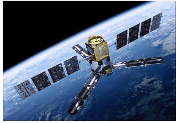
Fig. 1b. Large 2-D Aperture Synthesis Antenna (SMOS example)

Although these efforts are focused on achieving the best path forward for a future high resolution L-band (1.2-1.4 GHz) mission (both ocean and land surface), the antenna technology trade results are also applicable to other low microwave frequencies and could help define the best approach for multi-frequency missions