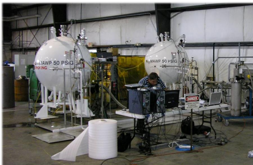
Figure 2. Liquid hydrogen testing of glass bubbles (and perlite powder) using two 1000-liter spherical tanks.