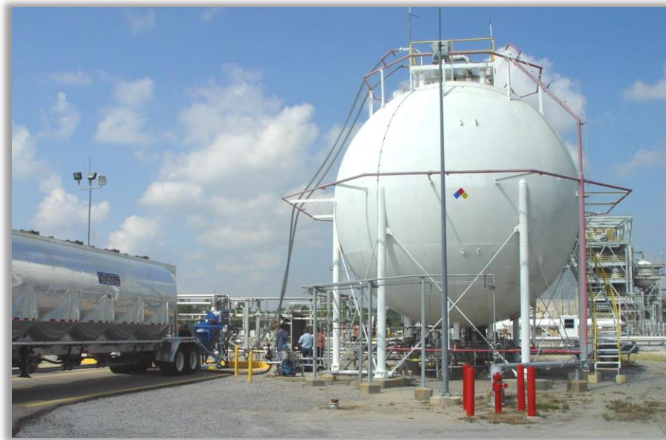
Figure 3. Field demonstration in a 50,000-gallon LH2 storage sphere at NASA Stennis Space Center. Shown is the process of loading glass bubbles into the annular space of the vacuum-jacketed tank.

Glass bubbles thermal insulation data are now included in ASTM C1774 Standard Guide for Thermal Performance Testing of Cryogenic Insulation Systems for reference, calibration, and engineered applications in cryogenic systems.