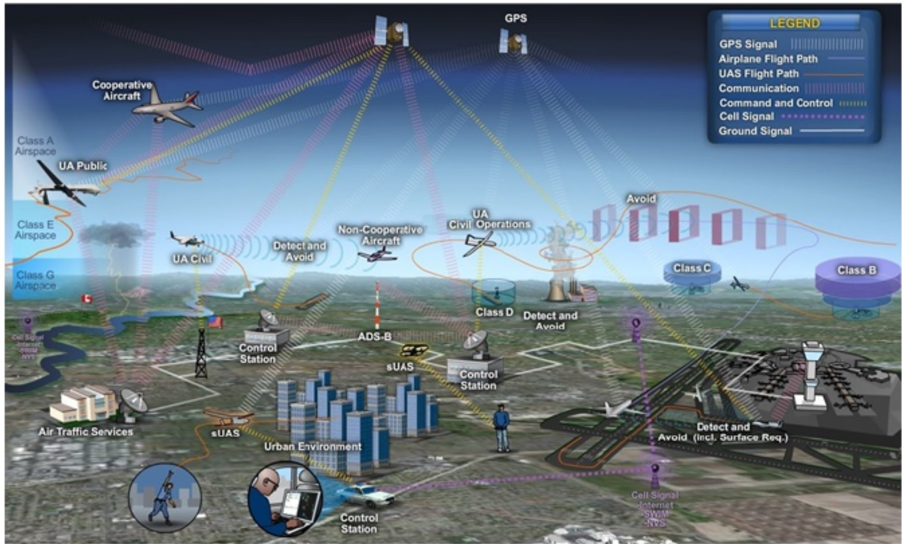
Sketch of concept