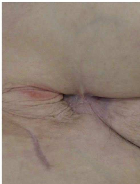
Figure 4: Approximately half a year post oblique flap; the wound is fully healed without a fistula.

muscle flap can help preserve the graft and assist in wound closure. The external oblique muscle is a Type V muscle with both dominant and multiple segmental vascular pedicles [7]. The dominant pedicles are one or two branches of either the deep circumflex iliac artery (94.7%) or the iliolumbar artery (5.3%) [8]. The segmental vascular supply is derived from the 5th through 12th posterior intercostal arteries. The use of the external oblique muscle has predominantly been described for chest wall reconstruction [9].