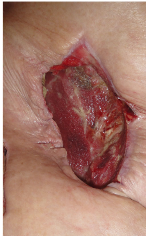
Figure 3: Appearance of the wound after removal of negative pressure, 4 days after the oblique external flap.