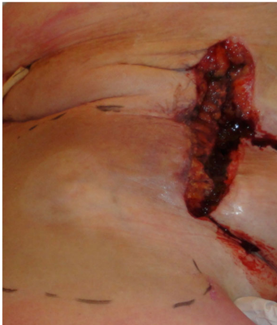
Figure 1: Macroscopic appearance after draining the hematoma and muscle transposition of the sartorius muscle.

Fourteen months after wound closure the patient was well and walked small distances. She had a completely healed groin