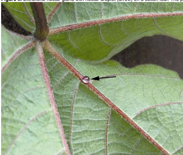
Figure II. Extrafloral nectar gland with nectar droplet (arrow) on a cotton leaf. The production of extrafloral nectar is an indirect defense response of the plant.