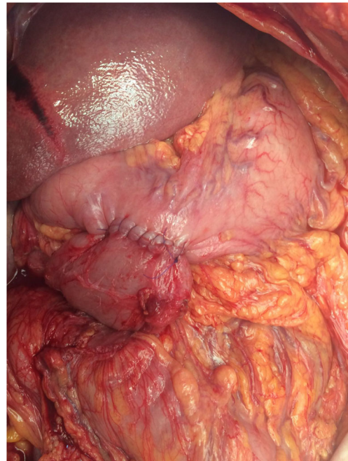
Fig. 2 Creation of a hand-sewn side-to-side duodenogastrostomy at the anterior part of the antrum in one patient

In the postoperative courses of the patients after the duodenogastrostomy or proximal jejunogastrostomy, no reoperations were needed. Anastomotic leakage or mortality did not occur. Review of the patient records revealed two sepsis-related complications, acute renal failure, and deep venous thrombosis, both completely resolved. Wound complications or other postoperative infections were not described.