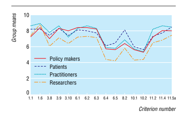
Fig 2 Criteria for which stakeholder effects were present at second round (see table for data and P values)

The free text comments prompted the addition of three new criteria for the second round (1.8b, 8.6, and 11.5b). The extra table on bmj.com reports the equimedian ratings achieved for each criterion after the second round. Of the 83 criteria, 41 were given an overall equimedian rating of 9, 28 a rating of 8, and 7 a rating of 7. Eight criteria (3.11, 3.12, 5.1, 5.3, 5.4, 6.4, 6.5, and 10.2) had equivocal ratings (rated 4 to 6 without disagreement). Of the 13 criteria in the domain "presenting probabilities," two had equimedian ratings of 5 and 6 (3.11 "describe how probabilities were calculated" and 3.12 "describe how probabilities were derived for patient subgroups"). Three of the five criteria in the domain "patient stories" (5.1, 5.3, and 5.4) all had equimedian ratings of 6. Two of two criteria that focused on offering a "trained coach to prepare patients to discuss decisions with their