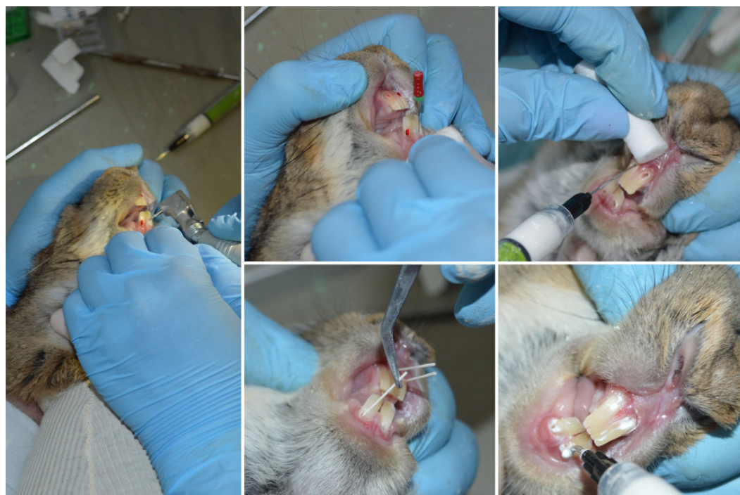
Fig. 1. Modeling of traumatic pulpitis with the preparation of hard tissues of the teeth; bleeding stopping; performing medical proceeding of the cavity and dry the cavity after that; direct pulp capping and filling the tooth with glass ionomer cement

Material and methods. We performed experimental investigation for study of the morpho-functional changes of the pulp tissues tissue with modeling of traumatic pulpitis (on rabbits, males, aging three-month) and direct pulp capping by next steps (Fig. 1).