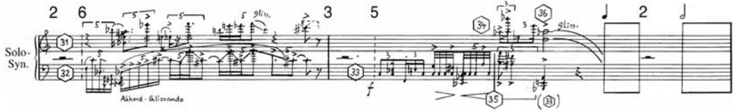
Figure 2: Klavierstück XV , Synthi-Fou m.26-27.