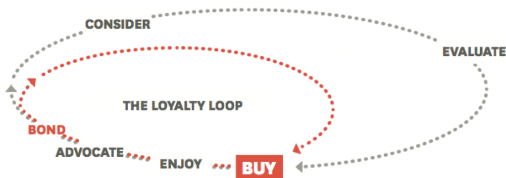
The Consumer Decision Journey [42]

This model provides a clear, realistic understanding of what’s really going on. The customer is going through a process when trying to purchase a product. And eventually, turn into a loyal customer that would promote and advocate to the products or the brands they liked. They can do that by sharing their experience online with other potential customers.