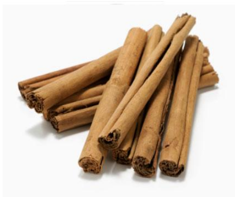
Figure 1.1 Bark of Cinnamomum Zeylanicum

The name cinnamon is consequent from the Greek word 'kinnamon'. Cinnamomum Zeylanicum belong to the diminutive evergreen tree in the Laurel (Lauraceae) family. The tree can grow up and reach a height in a range 6 m to 12 m. The stem is robust with between 30 – 60 cm diameters. Mature trees have a thick skin brown or gray and have many branches low with the tapered and rounded leaves. Cinnamon has the shape of small diameter stem and has a king-size or short. Exterior and interior color of cinnamon is light brown and the chemical properties of cinnamon are spicy, slightly sweet, warm and fragrant.