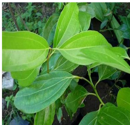
Figure 1.2 Leaves of Cinnamomum Zeylanicum