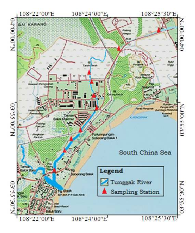
Fig. 1. Map of study area showing sampling stations

Water samples were collected monthly from preselected 10 stations during dry and wet season on 2011-12. During samples collection, in-situ data of pH, temperature, DO, turbidity, salinity, EC and TDS were also collected using YSI. APHA and HACH standard procedure was followed during sampling, sample transportation and preservation (Andrew and Franson, 2005; HACH, 2005). The three replicates of the physico-chemical parameters of the sampling water were measured at each selected sites and laboratory. Nitrogen was measured spectrometrically where, ammoniacal-N was assessed in nessler method and nitrate-N was estimated in cadmium reduction method. Sulphate and Phosphorous were also determined by using spectrophotometer and the measuring method was sulfavar 4 and ascorbic acid method respectively. Bio-chemical parameter COD measurement was done in COD reactor digestion method and BOD was analyzed in APHA method 5210. After collecting BOD samples initial reading was collected as soon as possible and then the BOD bottles were kept in incubator at 2018°C temperatures for 5 days. After 5 days final reading was taken and BOD was calculated with the following formulae.