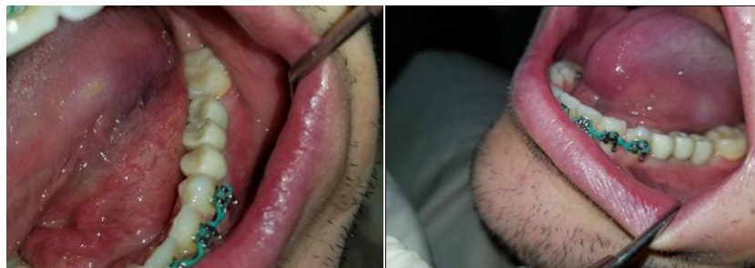
Image 8. View of placed single zirconium pin retained crowns

The patient was advised with instructions for massage using circular movements on the gums using NBF Gingival Gel®. Control examinations were done after 12 months, twice in the first 12 months, and once in every 12 months in the following 36 months (image 9,10,11)