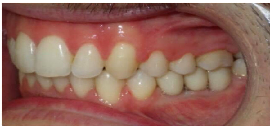
Image 11. Gingiva condition after 36 months