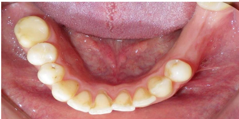
Image 3. Occlusal view of the dental ridge condition