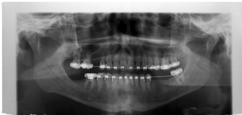
Image 1. Roentgen panoramic image before the treatment

The preoperative procedure consisted of detailed anamnesis and clinical examination with paraclinical exams such as basic blood analysis, computed tomography and roentgen panoramic imaging, with intention to determine the height of the bone, its density and also its thickness, and also to create the treatment planing. (image 1,2,3).