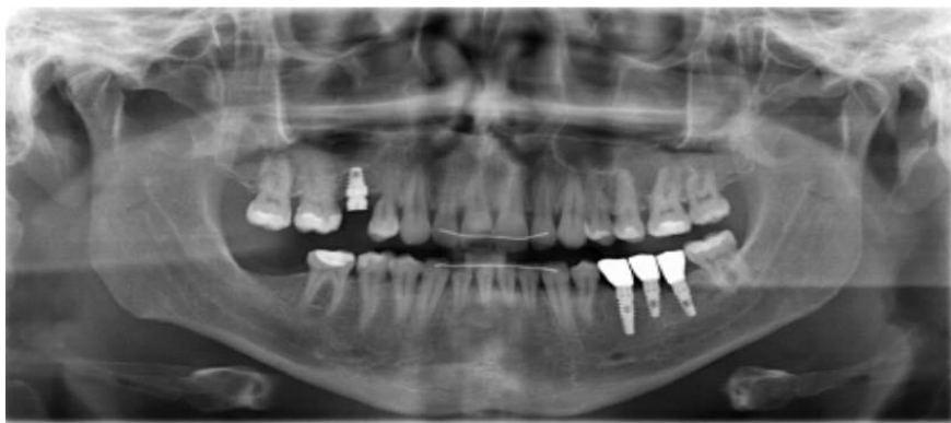
Image 10. Control panoramic roentgen image after 36 months