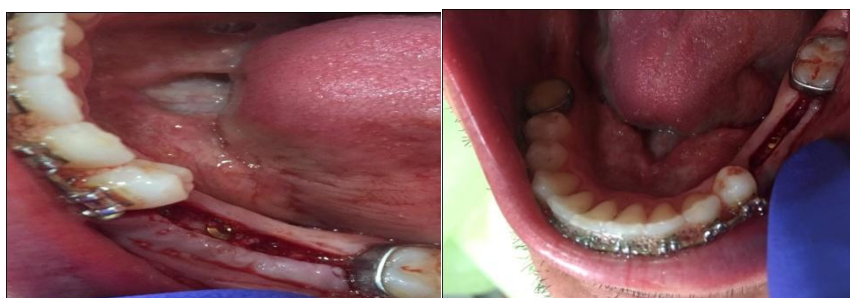
Image 5. Occlusal view of the placed implants in lower left quadrant

Placed implants BioHorizons Tapered Internal had the following dimensions: 3.8x 12mm, 3.5 Plat ; 3.8x 9mm, 3.5 Platform и 3.8x 9mm, 3.5 Platform. Due to the ridge resorption we had available height of 14 mm and width of 3.9 mm in the premolar region and height of 12 mm and width of 4.1 mm in the molar region, so it was indication for application of bone graft. Using Bone Scraper autologous bone was taken from the patient, that was placed as primary graft above the implant and on it was placed mixture of bone substituent 70% and bone graft MinerOss® XP Anorganic Bone Mineral 30% that were protected with artificial membrane Mem-Lok® Resorbable Collagen Membrane. With assistance of PenguinRFA® – OSSEOINTEGRATION MONITORING DEVICE the primary stability of the implants was determined, so the stability for the first implant placed on the second premolar position was 76 ISQ (resonance frequency analysis), second was with 68 ISQ, and the third was with 82 ISQ value. Therefore the flap was closed using single sutures and control roentgen images were made for evaluation of the procedure (image 6)