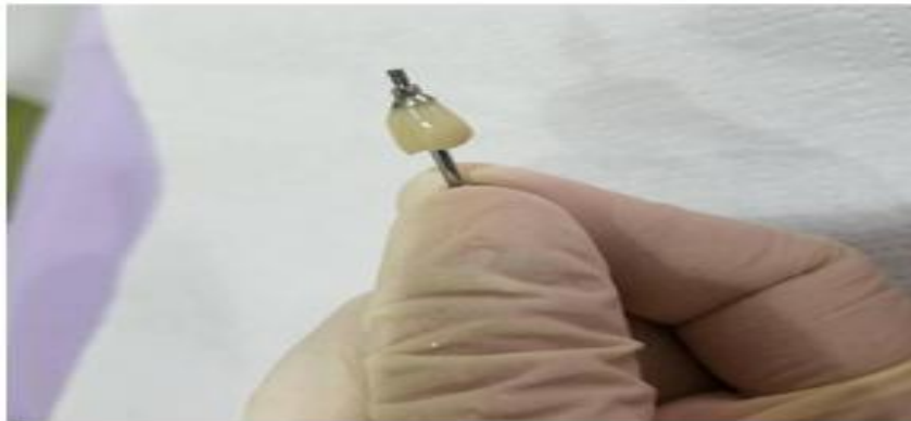
Image 7. Zirconium crown on second premolar, made on Ti – basis of penalties

After the adequate forming of the gingiva and ideal soft tissue healing, finally suprastructure was placed using single zirconium fine retained crowns (image 7,8)