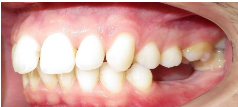
Image 2. Dentition and ridge condition before the treatment