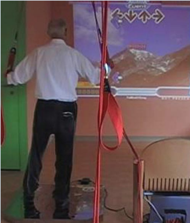
Fig. 1 ▲ Training set-up for the dance pad game. The core game play involves the player moving his or her feet to a set pattern, stepping in time to the general rhythm or beat of a song. During normal game play, arrows scroll upwards from the bottom of the screen and pass over a set of stationary arrows near the top (upper red circle) referred to as the “guide arrows” or “receptors”. When the scrolling arrows overlap the stationary ones, the player must step on the corresponding arrows on the dance platform (lower red circle), and the player is given a judgement for their accuracy (Marvelous, Perfect, Great, Good, Boo/Almost, Miss/Boo) [51]