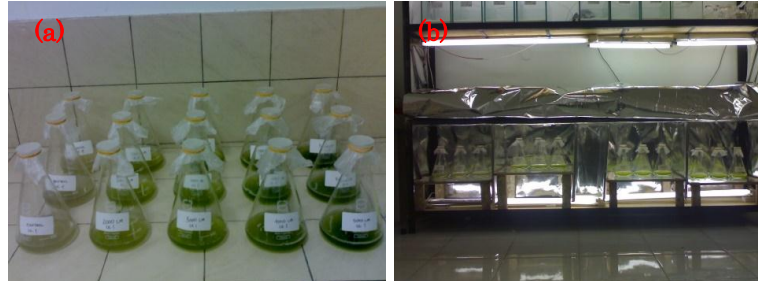
Figure 1. (a). Growth profile of Scenedesmus sp. in different concentration of tapioca wastewater (b). Different concentration of Scenedesmus sp. culture in growth chamber