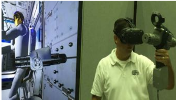
Figure 2. NASA's HR lab showing a user viewing a photorealistic pistol grip tool (PGT) inside an HTC Vive headset, while manipulating a 3D printed PGT that allows for physical feedback.

with handheld instruments such as the pistol grip tool (PGT).