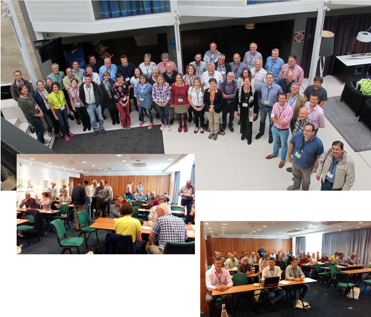
Figure 1 EGF Working Group "Grazing" in Trondheim in 2016.

Both the plenary presentations and the group discussions are summarized in this report. The state of the art of grazing in Europe is described in Chapter 2. Chapter 3 reports on our high tech world. Chapter 4 reports on high-tech methods. Chapter 5 reports on how to reach (young) farmers in a high-tech world, followed by some concluding remarks in Chapter 6. Both this report and pdf-files of the presentations of the meeting can be found at the EGF website under the pages of the Working Group "Grazing" ( www.europeangrassland.org/working-groups/grazing ). The program of the meeting can be found in Appendix 1 of this report.