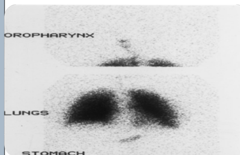
Fig 3: Gamma camera scans showing the deposition of the radioaerosol in the oropharynx (top) and lungs (bottom) of a patient with NIDDM