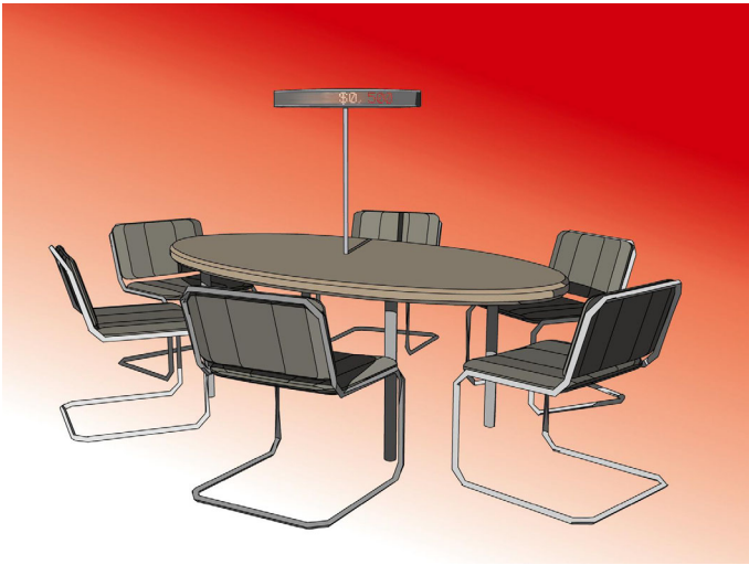
Figure 2: The Meeting Cost Counter

meeting (including overheads). This information is then displayed on the circular screen mounted above the meeting table, which updates every second.