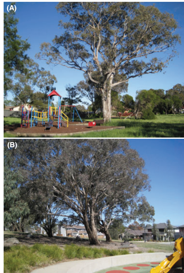
Figure 1 (A) Example of a typical urban park with a large tree (Burrinjuck Crescent Neighborhood Park, Duffy, Canberra, Australia). (B) Example of planned landscaping separating children's play area (foreground) and large trees (Heritage Park, Forde, Canberra, Australia).

We conducted our study in Canberra, Australian Capital Territory (ACT), in southeastern Australia. Canberra is approximately 800 km 2 , and has a population of 362,000 people. Population density is approximately 452 people per km 2 (ABS 2010). The city is known as the “Bush Capital” and there is substantial urban tree cover across public and private land. Within public land,