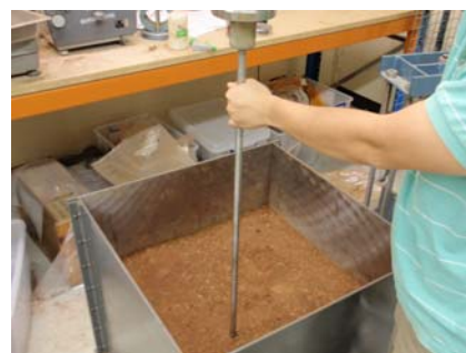
Fig. 1 DCP test in the CBR mould (M1) and in the 700 mm × 700 mm × 700 mm mould (M2).