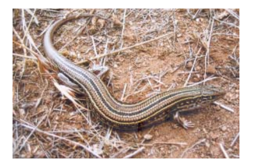
Fig. 4. Large Striped Skink Ctenotus robustus .

fence post beside an ephemeral wetland and under galvanised iron in grassland at Challicum. One sub-adult Eastern Brown Snake Pseudonaja textilis was recorded under a roof tile on this property. An Eastern Brown Snake was recorded under a large paver at the GFGC. Lowland Copperhead Austrelaps superbus was recorded under pavers and galvanised iron at QHBP and under pavers at GFGC. Little Whip Snake Parasuta flagellum (Fig. 5) was recorded under all forms of artificial habitat at all three study sites.