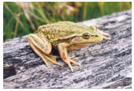
Fig. 6. Growling Grass Frog Litoria raniformis.