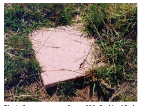
Fig. 2. Concrete paver at Quarry Hills Bushland Park.

Artificial habitat at GFGC was monitored on six occasions, once every six months between September 2008 and May 2011.