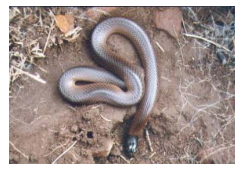
Fig. 5. Little Whip Snake Parasuta flagellum .