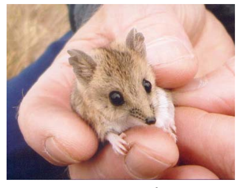
Fig. 3. Fat-tailed Dunnart Sminthopsis crassicau data .