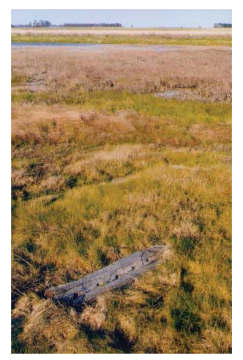
Fig. 1. Old fence posts beside restored ephemeral wetland at Challicum.

Standard roof tiles, galvanised iron (Average: 800 x 800 mm) and concrete pavers (380 x 380 x 45 mm) were used at this site (Table 1). In March 2006, five lines of roof tiles, with 10 tiles