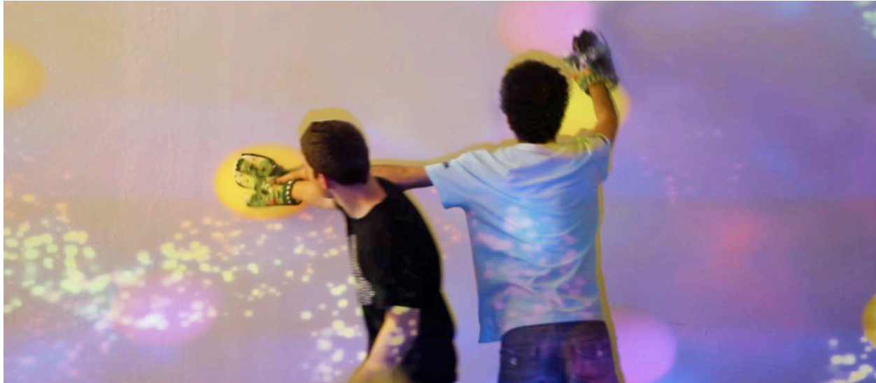
Figure 1. Two players competing in Bubble Popper. The player on the right uses his arm to block the opponent.

{chad, josh, floyd}@exertiongameslab.org