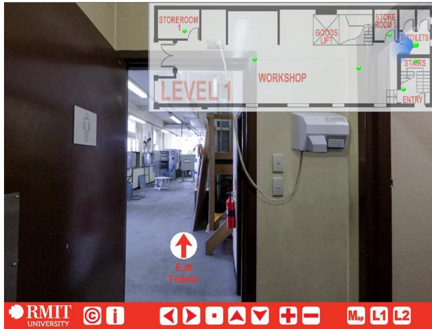
Figure 1: Screen capture of Nicola Building Virtual Tour

The Nicola Building simulation is a web-based Virtual tour not unlike what property services personnel employed within the real estate industry are familiar with, with exceptions mainly related to purpose. An example of divergence is that most property tours aim to highlight advantages while a building inspection for learner critique needs a more realistic view; they need access to both faults and advantages to enable a realistic facility report to be produced. The Nicola Building comprises two floors, and allows the learner to navigate their own way through the building moving from area to area as they choose. Depending on the intended learning outcomes for each relevant course activity, the teacher sets instructions utilising the tour, predominantly for what type of inspection report is required but also for other learning purposes such as safety and risk analysis. The learning goal in the trial was to produce an inspection report detailing the current condition of a facility, emulating the standard required in the industry.