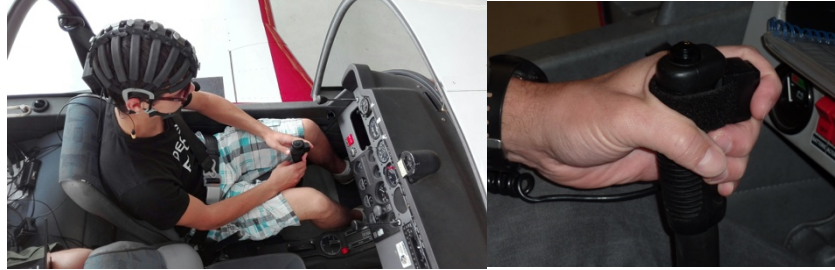
Fig. 1: Left: a participant equipped with the 64-channel Cognionics dry electrodes system. The aircraft was a Robin DR400. Right: the response button attached to the stick.