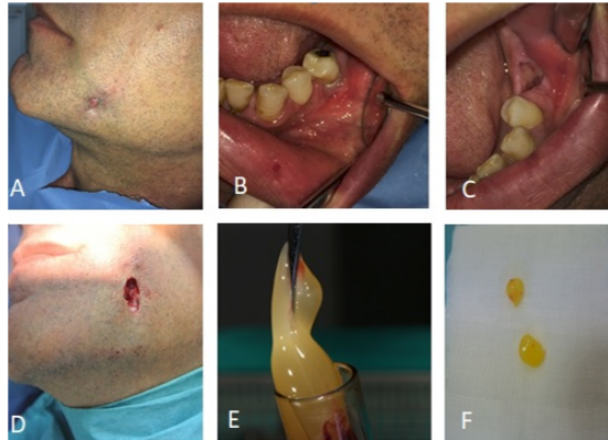
Fig. 1. A. Pre-operative extra-oral situation. Note the buttoned cutaneous fistula. B. Intra-oral view. Note the deep cavity on tooth 3.5. C. The causative tooth extracted. D. The surgically removal of the fistula. E. The PRF clot. F. The compressed clot in shape of membrane

using sterile pliers (fig. 1E). The clots were digitally compressed between two gauzes in order to obtain maneuverable membranes (fig. 1F).