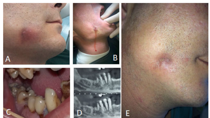
Fig. 4. A. Extra-oral aspect of the sinus tract. B. Discharge of a reduced amount of sanguinolent content. C. Poor oral hygiene, multiple carious lesions and loss of periodontal support. D. CBCT image presenting the osteitic lesion including the residual roots of tooth 4.6 and the crater-like deep osseous defect of tooth 4.4. E. Cutaneous unesthetic retractile scar, five weeks after the surgery

Computed tomography revealed a large, irregular radiotransparent area of 1.5 cm in diameter of the right mandible region, including the residual roots of tooth 4.6, and a large circumferential periodontal defect of tooth 4.4 (fig. 4D). The images suggested tooth 4.6 as the origin of the lesion. The patient agreed to a surgical intervention limited only at the removal of the etiological tooth.