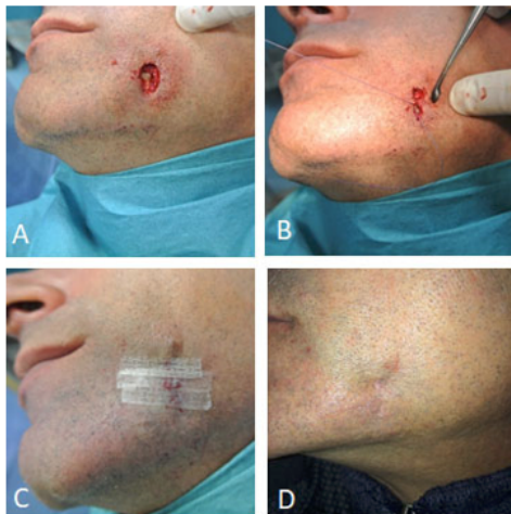
Fig. 2. A. The folded membrane pushed into the surgical wound. B. The cutaneous plane sutured. C. Steri-stripes to approximate the margins of the wound. D. The healed wound at 4 weeks after the surgery. Note the completely scar-free aspect and normal pigmentation & pilosity

The first PRF membrane was inserted in the wound (fig. 2A). The suture of the muscular plane was performed using resorbable vycril 4/0 sutures. The last PRF membrane was inserted between the muscular and the cutaneous plane, the latter being sutured with braided vycril 4/0 sutures (fig. 2B). Steri-strips were used to approximate the cutaneous plane (fig. 2C). The same oral medication as in the previous case was prescribed, as well. In both cases, the healing occurred uneventful, the sutures were removed after ten days. Daily massage with Contractubex gel (Merz Pharma GmbH & Co., Frankfurt/Main, Germany) was recommended for the next two months post-operatively, in order to enhance the skin mobility and to avoid developing of retractile scars. At one month, in the case treated with L-PRF, the former surgical area presented a completely scar-free aspect, of normal pigmentation and pilosity, with a slight dimple (fig. 2D). The timeline of case 1 is displayed in figure 3.