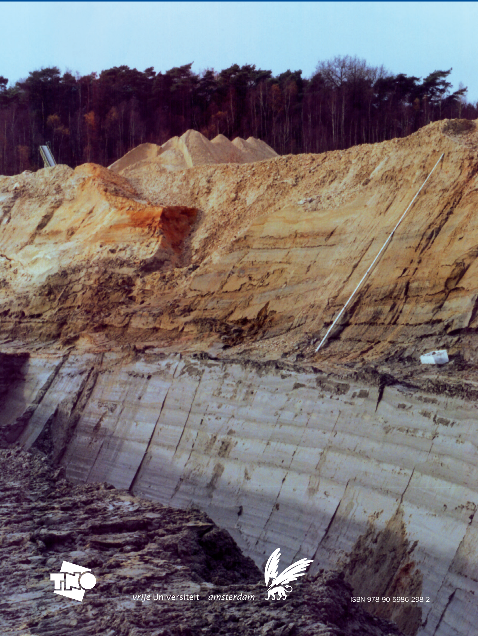
Stratigraphy and sedimentary evolution The lower Rhine-Meuse system during the Late Pliocene and Early Pleistocene (southern North Sea Basin)