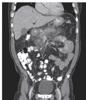
Figure 2 A transversal CT-image of a 54-year old male, who developed post-DBE pancreatitis (case 4), showing edema and fatty infiltration around the pancreas.

explanation since this would most certainly have been reflected in total procedure time, which was almost the same in patients developing pancreatitis and those who did not. Additionally, post-DBE pancreatitis did not occur more frequently after procedures performed by fellows. A third possible explanation could be an underestimation of post-DBE pancreatitis in previously published studies, as is evident in the study by Zhong, which reports two patients with abdominal pain and increased serum amylases without labeling these cases as pancreatitis [24] . Especially, retrospective questionnaire based surveys might be at risk from report or inclusion bias. Differences in definitions of post-procedural complications offer a likely explanation for the difference in reported post-DBE pancreatitis. Since we conducted a review of a recorded database prospectively, using predefined definitions of pancreatitis and its severity, the chance of report or inclusion bias seems lessened.