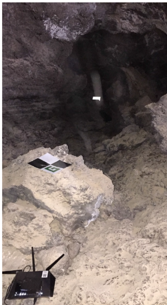
Figure 2. Test 10 setup.

The results of the test are provided in the Table 1, while the laptop location is shown in Figure 4.