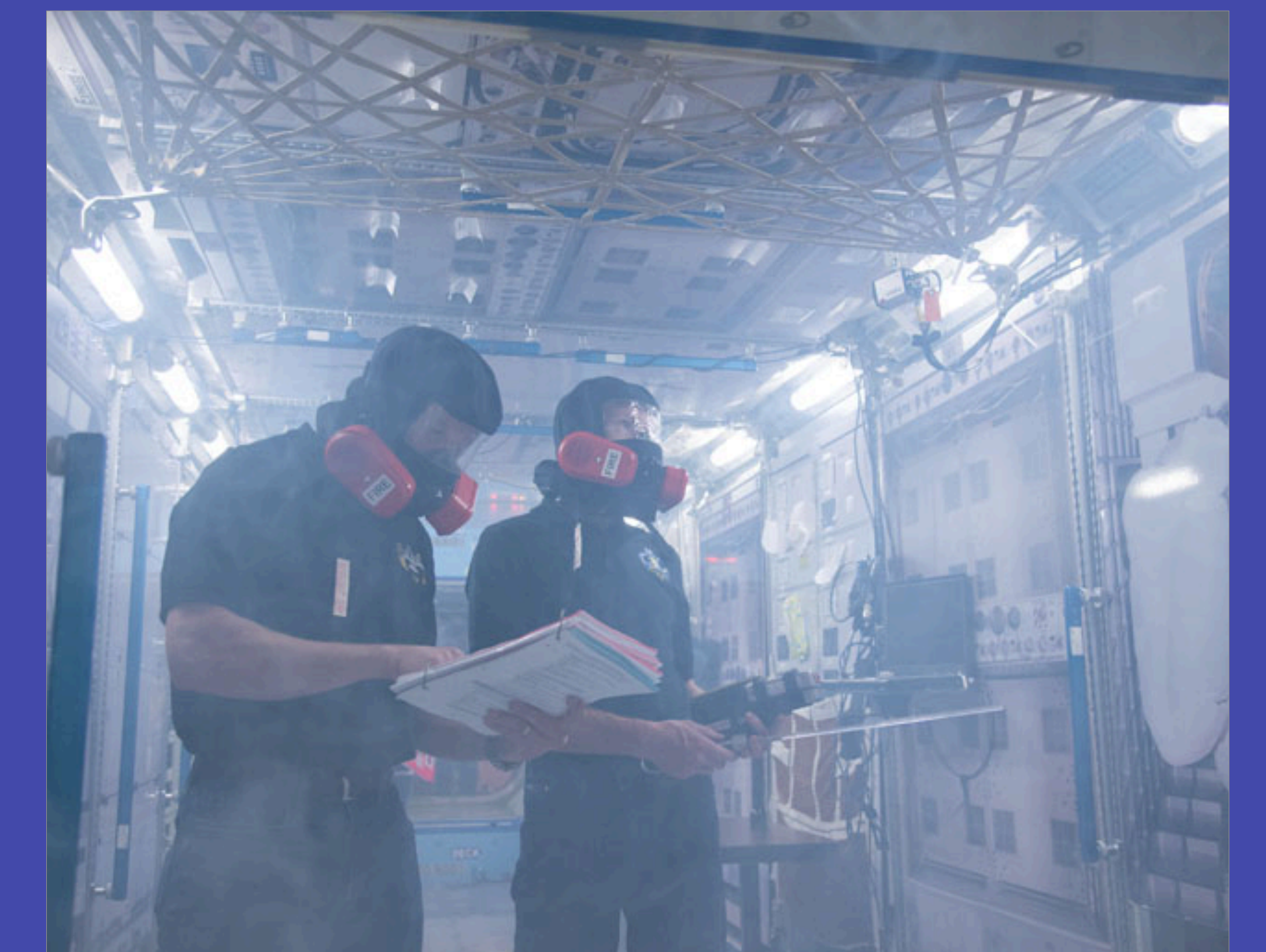
Figure 5. Photo jsc2015e004471 Courtesy of NASA. Expedition 46 crew members Tim Kopra of NASA, left, and Tim Peake of the European Space Agency, engage in emergency scenario training.

While NASA does not require a final summative evaluation across all disciplines, Russia does conduct a final summative evaluation of all crewmembers conducted in both their Russian Segment training modules and in their Soyuz training module. Crewmembers normally launch within a few weeks of this final evaluation.