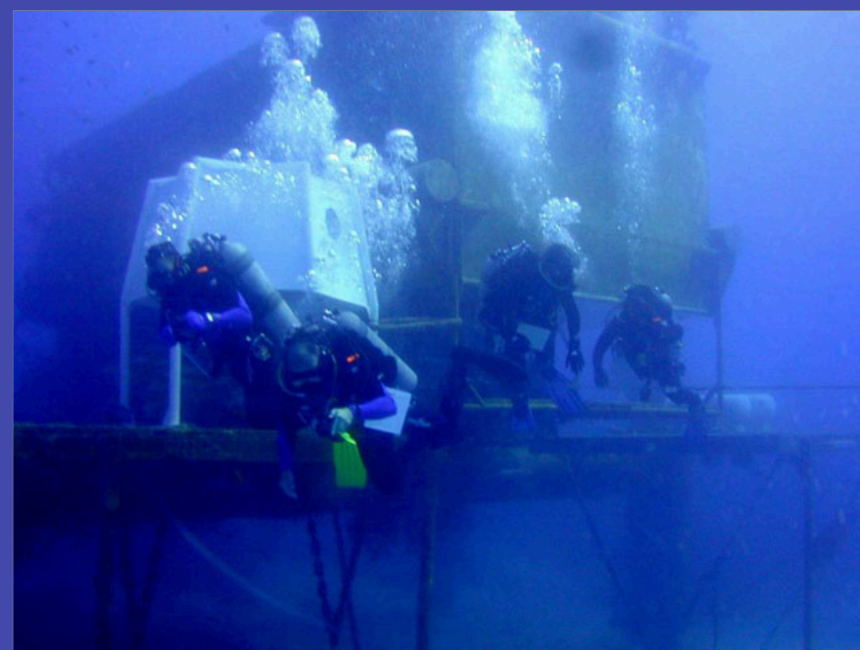
Figure 3 (bottom). NEEMO is conducted in the Aquarius Reef Base underwater laboratory owned by Florida International University.