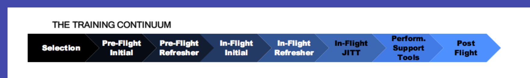
Figure 1. This research encompasses the entire training continuum, from selection through pre-flight training to onboard and post flight training.

NASA's unique expertise in spaceflight training is extensive and encompasses all aspects of a training program, from the management of training resources, including training personnel and training facilities, to the design and implementation of training across the entire training continuum for crew (astronauts), flight controllers, and analysts (see Figure 1). This research is scoped specifically to those best practices and lessons learned within the crew training program that lead to effective skill acquisition, retention (recall/memory), and transfer (generalization to new situations or tasks) and thus effective onboard performance. An overview of the ISS crew training continuum is presented here.