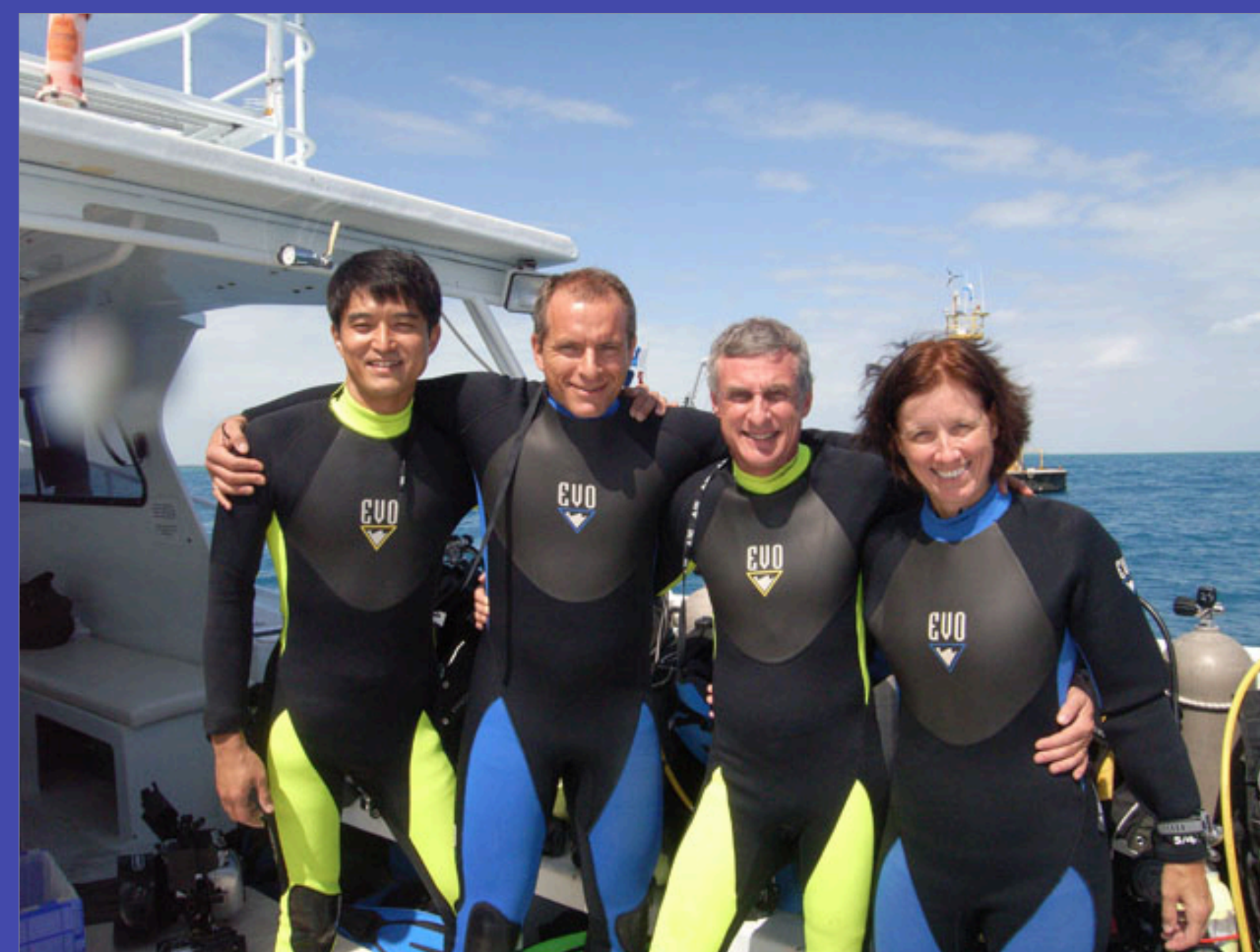
Figure 2 (top). Photo jsc2013e053810 Courtesy of NASA. The NASA Extreme Environment Mission Operations (NEEMO) analog mission provides effective teamwork and leadership training.

The preassigned training flow is designed to maintain proficiency in skills trained in the ASCAN flow until the astronaut is assigned to a mission. Proficiency training includes optional participation in analog missions (Figures 2 and 3).