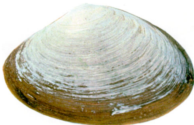
Fig. 2 Spisula polynyma (Alaska)

polymerase pathway, and p53 phosphorylation [5]. Four different administration schemes of single-agent Spisulosine have been assessed in separate clinical phase I studies [6–9]. The current trial evaluated a 3-h infusion given i.v. every week in 3-week intervals, with the objective to identify the MTD, to establish the safety profile of this schedule, to assess preliminary signs of antitumor activity, and to assess the PK profile of this novel compound.