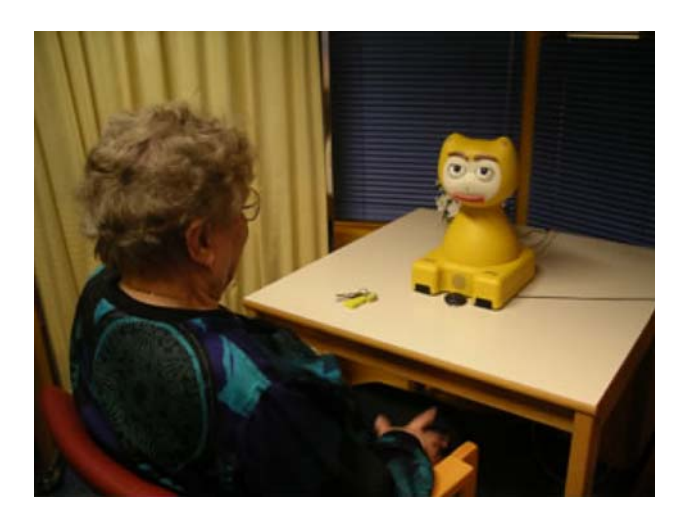
Fig. 1 The iCat as used in the experiment

Participants were elderly people (17 male, 23 female) between 65 and 96 years old, living in eldercare institutions in the cities of Lelystad and Loosdrecht, in the Netherlands. They were divided among the two conditions as equally as possible (the social condition featured one more male and one less female). They were first exposed to