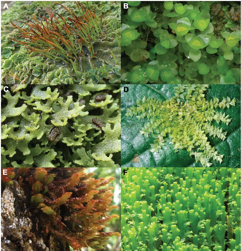
Figure 1. Habit images of selected lineages of Anthocerotophyta (hornworts) and Marchantiophyta (liverworts). A Phaeomegaceros squamuliger, B Haplomitrium mnioides, C Conocephalum japonicum, D Colura vitiensis, E Pleurozia gigantea, F Riccardia spegazziniana