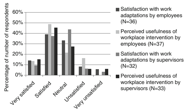
Fig. 4 Satisfaction and perceived usefulness rated on a 1–5 scale by the employees and the supervisors as a percentage of the number of respondents

employees. More than half of the employees and two-thirds of the supervisors expected the intervention to have positive effects on RTW. Even though the workplace intervention focused on RTW, the expectations of the OPs with regard to recovery of symptoms were positive for almost one-third of the employees. The usefulness of the workplace intervention and satisfaction with the work adaptations were most frequently rated positively by the employees and the supervisors (Fig. 4).