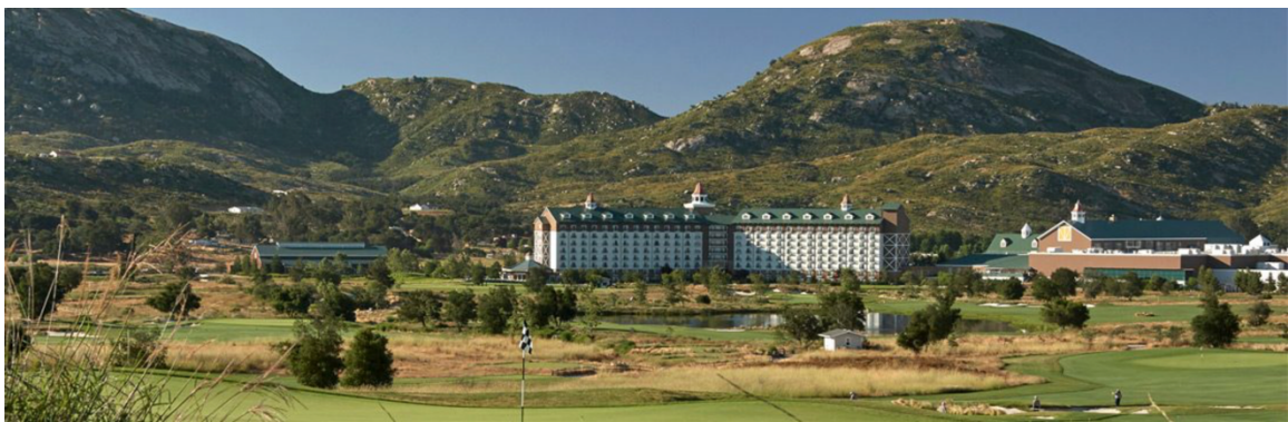
Barona Resort and Casino.

In 1998, Don Speer and the people of Barona began plans with architect Joel Bergman to build a new $225,000,000 casino. Bergman had helped design the Golden Nugget (Atlantic City), the Mirage (Las Vegas), Caesar’s Palace (Las Vegas), The Paris Casino and Resort (Las Vegas), and numerous other projects. Significantly, Barona’s first gaming compact with the state was signed during the preliminary stages of the new casino on October 8, 1999. 156