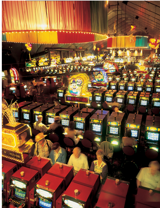
Big Top Barona Casino.

Speer and the people of Barona soon turned their gaming operation around. Eventually the tribe would accumulate enough money to expand into a bona fide casino, the Big Top Barona Casino, that opened in 1994.