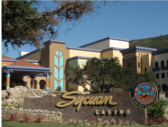
Sycuan Casino.

In 2011, Sycuan Casino spent twenty-seven million dollars to renovate their casino “reminiscent of a Sultan’s palace.” They gutted “the entire casino, section by section,” added a world class sports bar, and expanded the buffet. 168 The total square footage is 305,000, which is equivalent to Viejas’ floor plan. Currently, the Sycuan casino has a total of five restaurants and “the Bingo Palace on the second floor...can easily be said to be the most elegant bingo in San Diego” (150). 169