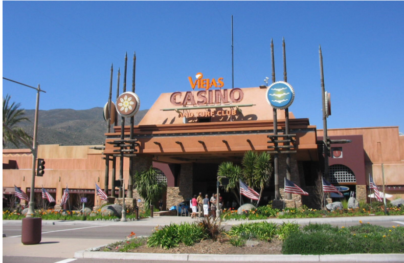
Viejas Casino and Resort.