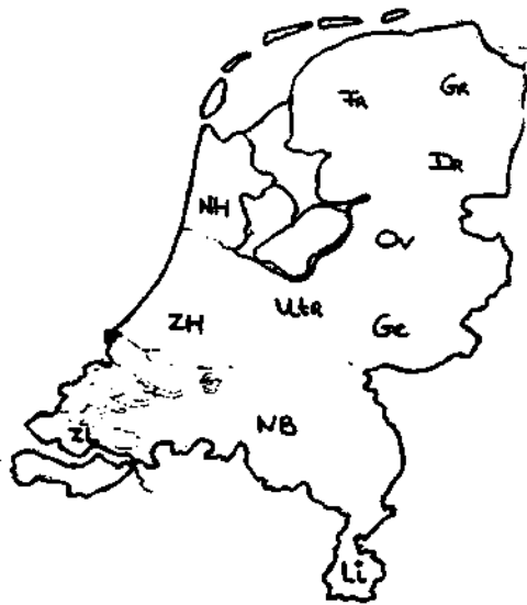
Figure 3.1 Location of the Dutch Provinces.