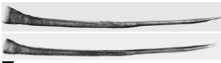
Figure 2. Light microscopy photographs of two darts of Polymita muscarum in side view. Cross-sections of the dart are circular, i.e., without blades. (Scale bar = 100 \mu\text{m} .)

zone is perhaps best described as ‘rubbing’. During the rubbing motion the dart apparatus is partially extended (fig. 1B) and seems to make small (semi-)circular movements.