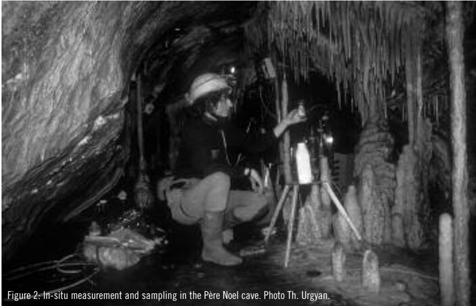
Figure 2. In-situ measurement and sampling in the Père Noel cave.