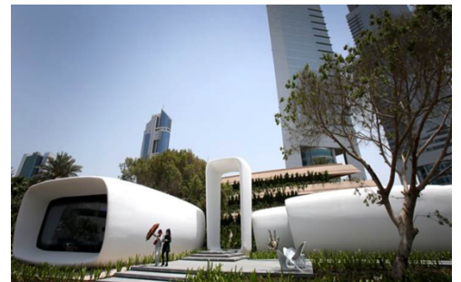
(a) 3DP Office