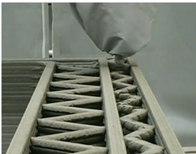
(a) Internal Reinforcement