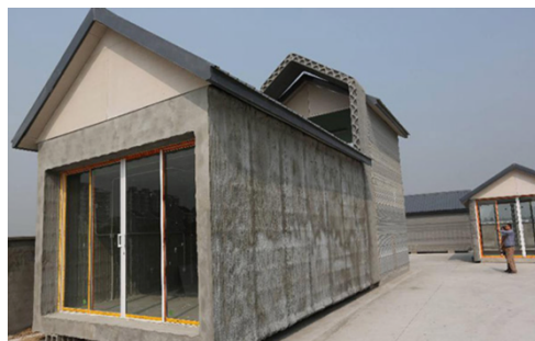
(b) 3DP House