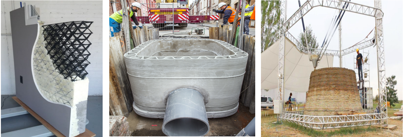
(a) C-Fab Wall Partitions