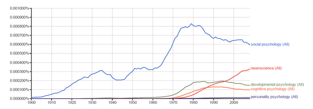
Fig. 2 : Searches for the terms "social psychology," "neuroscience," "cognitive psychology," "developmental psychology," and "personality psychology" from 1900 to 2008 (the most recent year for which there were available data) in Google Books Ngram Viewer. [Colour figure can be viewed at wileyonlinelibrary.com]

Among the good news for social psychology is the considerable outreach by social psychologists to general audiences, and the penetration and impact of social psychological ideas on the popular culture. This is manifest in the increasing number of popular, so called trade books, op-eds in major newspapers (like The NY Times, The Guardian, or the Washington Post), media appearances (even commercials!), public speaking such as at TED conferences, where social psychologists give some of the most popular talks of all times, and participation in political campaigns and political advisory boards. The increasing popularity of social psychology in public awareness can be seen using Google Books Ngram Viewer, which depicts the relative frequency of certain words and phrases in a corpus of published books. As Figure 2 shows, the term "social psychology" has experienced an immense increase in popularity over the past hundred years. Although other subfields of psychology (especially neuroscience) now appear to be on the rise as well, social psychology still remains the most prevalent subfield by far.