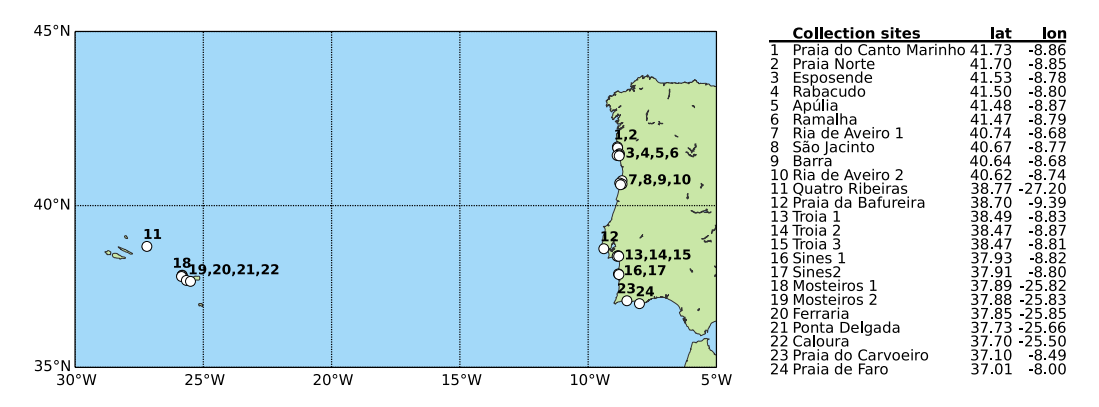
Figure 3. Location and coordinates (decimal degrees) of the 24 sites were gastropod specimens were collected from 2009 to 2015. The figure was created using python3/matplotlib.