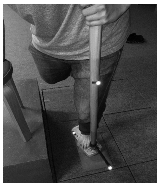
Fig. 1. Subject applying weight vertically on the force platform

when wearing Japanese traditional wear kimono. It is then light weighted device less than 0.5 kg, portable and can be used to calibrate the gait analysis laboratory force platforms.