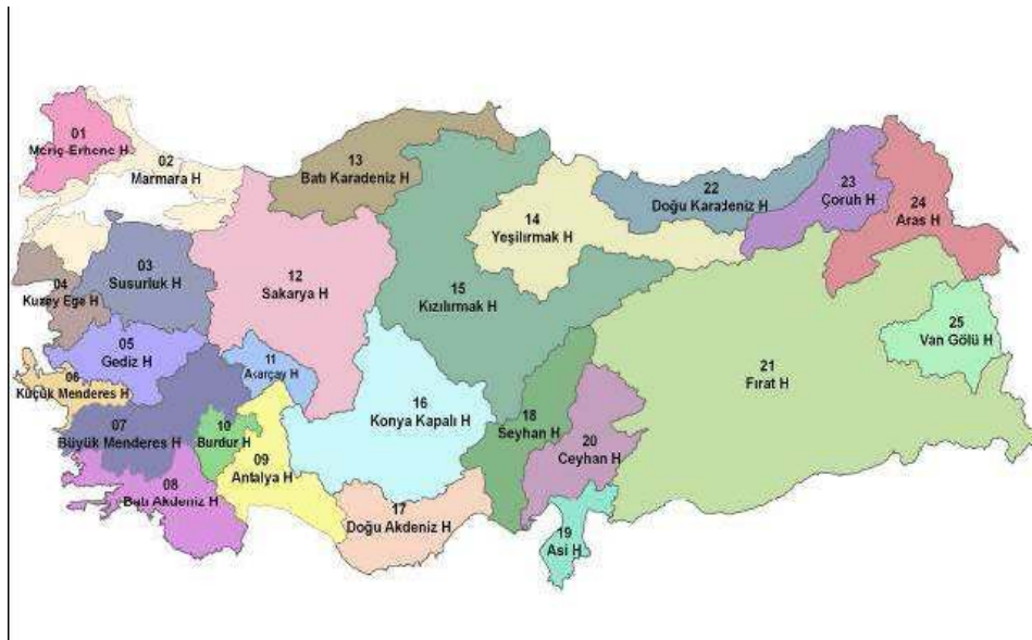
Figure 1. Basin in Turkey and position of Konya Closed Basin

Each of the basins is characterized by the presence of a large lake, respectively Tuz Lake and Beyşehir Lake (see Figure 2). Tuz Lake is fed by three major rivers, several ephemeral streams, one man-made drain channel (Camur & Mutlu 1995) and groundwater. Konya basin is fed by rivers and groundwater coming mainly from the south and by melt water and rainfall from the mountain range bordering the basin in the south (Fontunge et al. 1999). Besides the two large lakes, numerous smaller fresh water bodies, wetlands and salt steppes are present.