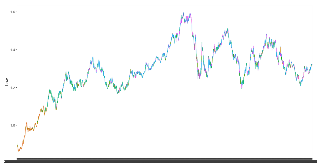
DateTime Figure 2: EUR/USD GMM Clustering

ground truth in obtaining the three (3) performance benchmark selected. Table 1 gives the forecasting results on the Close Price, and forecasting results on the Low Price are listed in Table 2.